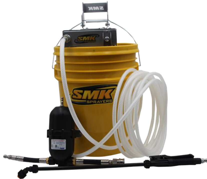
C100WOLXD Silica Dust-X Sprayer SMK Sprayers